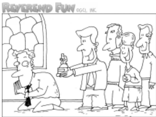
CONGRATULATIONS ... YOU HAVE BEEN VOTED THE MOST VALUABLE PRAYER