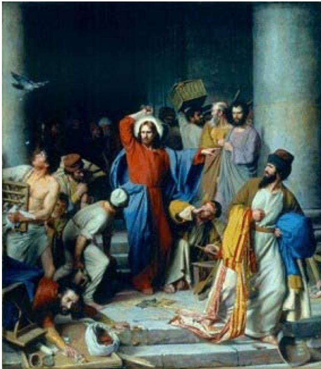
“The Money Changers” by Carl Heinrich Bloch