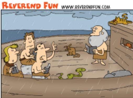
CAN WE PLEASE NOT SING "OUR GOD REIGNS"?